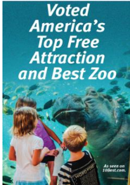
St. Louis Zoo