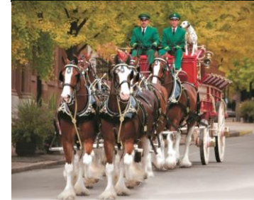
The World's Famous Clydesdales