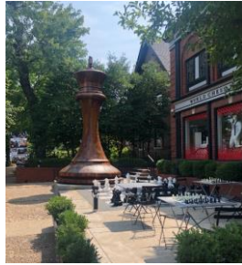
World Chess Hall of Fame